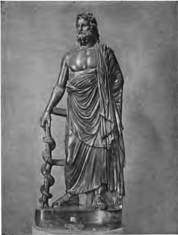
Fig. 19. Asclepius.